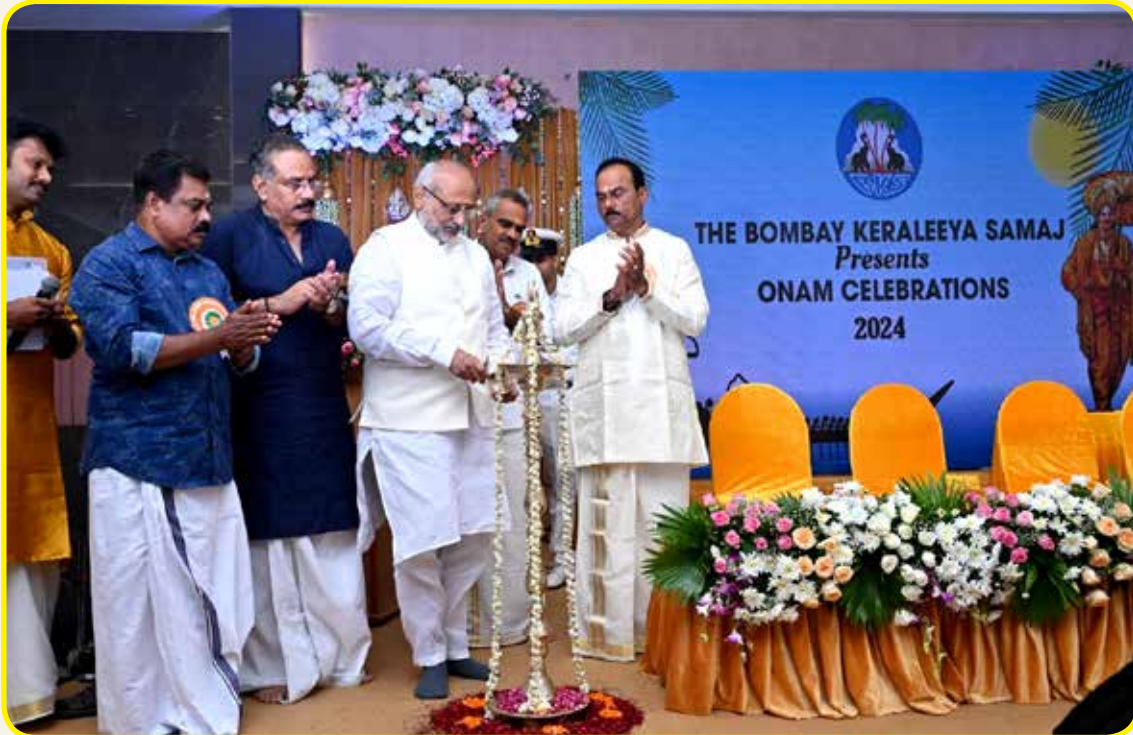
Onam Celebration Programme held on 22 September 2024, at Manava Seva Sngh, Sion