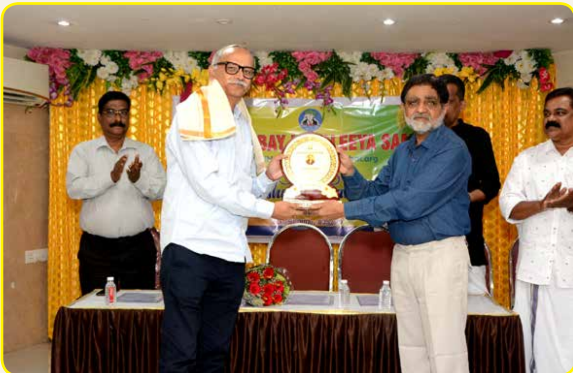
Vishu Celebration Programme held on 12 April 2025, at Navathi Memorial Hall, Kerala Bhavanam, Matunga